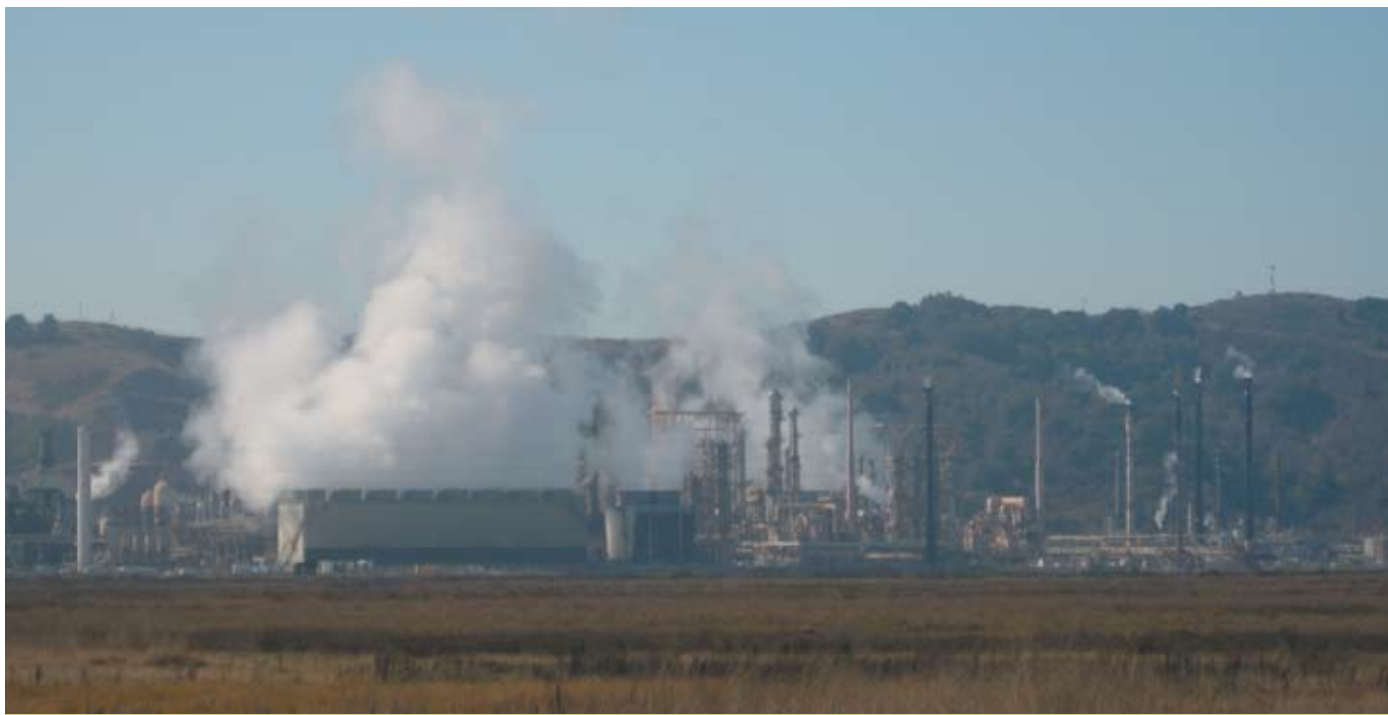
Chevron Richmond Refinery