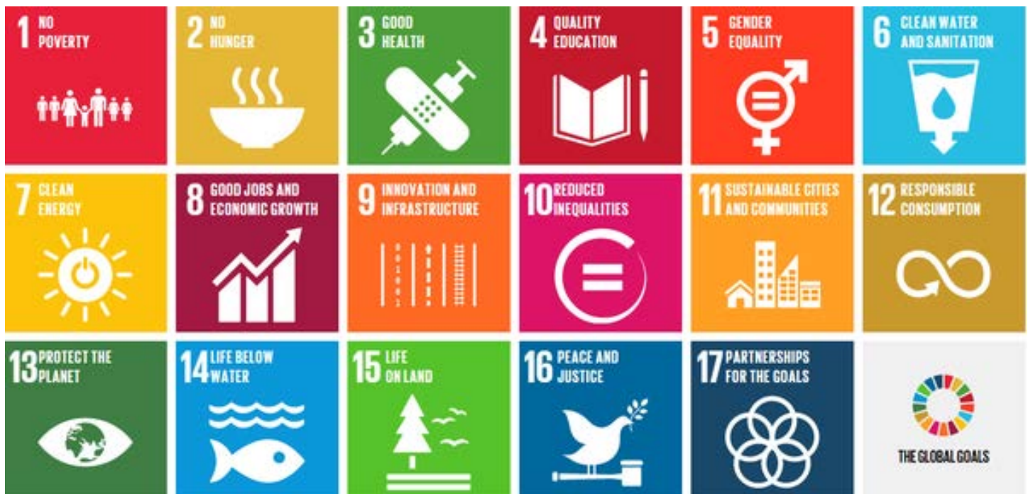
Figure 1: Global Sustainable Development Goals

Over the past decade, an increasing number of companies recognize that water poses a significant risk to their business and have begun to take action to mitigate their risks via improved water management practices and stewardship. We propose a new recognition that companies seeking to manage water-related business risks can and should contribute to improved water and sanitation management and governance that is also in the public interest.