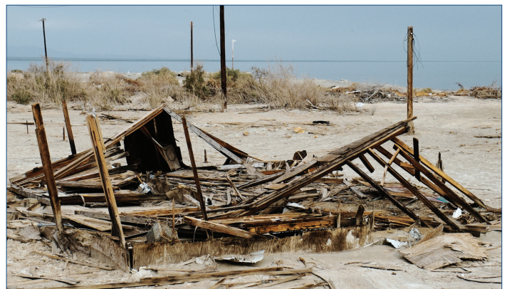
Bombay Beach ruin, on the shore of the Salton Sea.

The objective of this report is to estimate the costs of inaction - defined as the absence of any large-scale revitalization or air quality management project - at the Salton Sea, to provide decision-makers and the