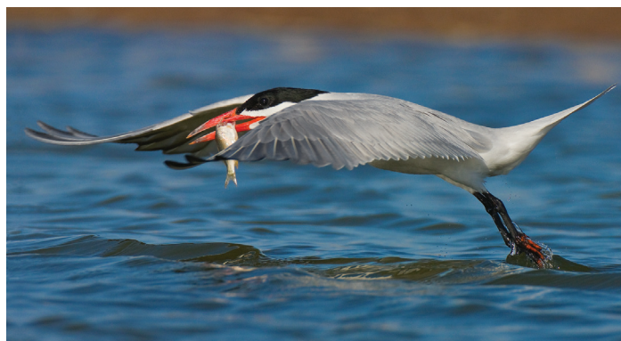
Caspian tern at the Salton Sea.

The Salton Sea currently provides tens of thousands of acres of shoreline and near-shore habitats to hundreds of thousands of birds. More than 400 species of birds use the Salton Sea, including a large number of special status species. As the lake deteriorates, the size and quality of its habitats will diminish, reducing its value to the resident and migratory birds that depend upon it. Through contingent valuation surveys and other methods, people have expressed a willingness to pay to preserve similar values at other locations. Previous studies have indicated that Californians as a whole have valued wetland habitats at about $60,000 per