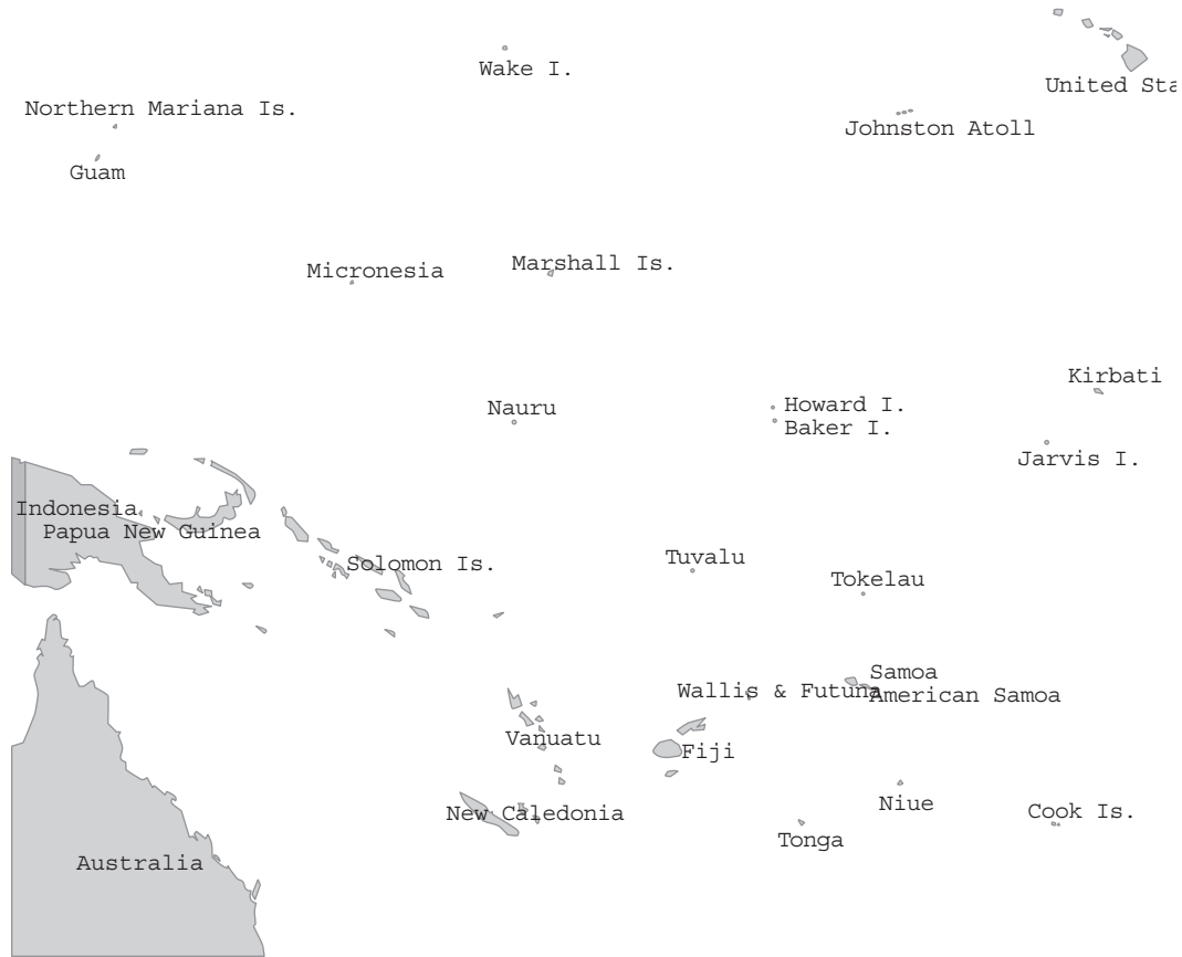
FIGURE 5.1 Pacific Island Developing Countries.

2000) (see Table 5.1). Almost all PIDCs lie between 30° north and 30° south latitude, between the Tropic of Cancer and the Tropic of Capricorn in the southwestern portion of the Pacific (U.S. Naval Meteorology and Oceanography Command 2001). With the exception of Papua New Guinea and Fiji, all PIDCs fall within the United Nations' definition of "small island states," which are islands with land areas smaller than 10,000 square kilometers and with fewer than 500,000 inhabitants (Pernetta 1992, Bequette 1994). The majority of countries in the region fall well below these thresholds, with populations below 200,000 and land areas well below 1,000 square kilometers, and many fall into the category of "very small islands," with land areas less than 100 square kilometers or a maximum width of 3 kilometers (Dijon 1994). The combined population of PIDCs in the region is slightly over 6 million, the lion's share being in Papua New Guinea (Kaluwin and Smith 1997). PIDCs comprise only 10 percent of the land area in the Pacific (Asian Development Bank 2001).