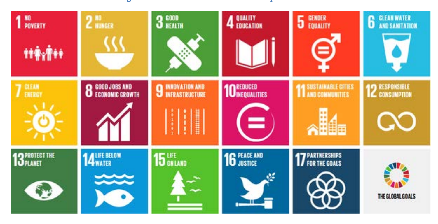
Figure 1: Global Sustainable Development Goals

Over the past decade, an increasing number of companies recognize that water poses a significant risk to their business and have begun to take action to mitigate their risks via improved water management practices and stewardship. We propose a new recognition that companies seeking to manage water-related business risks can and should contribute to improved water and sanitation management and governance that is also in the public interest.