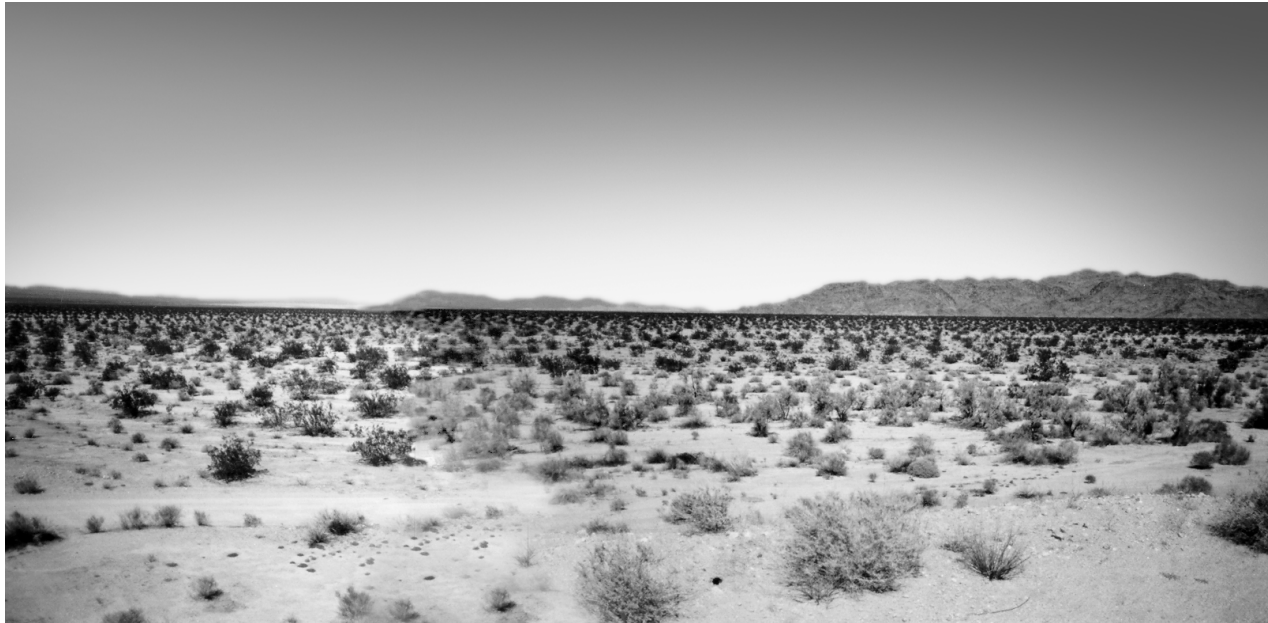
6. From the proposed substation looking north along the water conveyance facility alignment.