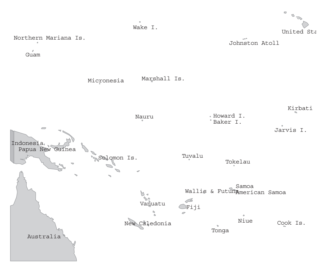
FIGURE 5.1 Pacific Island Developing Countries.

2000) (see Table 5.1). Almost all PIDCs lie between 30° north and 30° south latitude, between the Tropic of Cancer and the Tropic of Capricorn in the southwestern portion of the Pacific (U.S. Naval Meteorology and Oceanography Command 2001). With the exception of Papua New Guinea and Fiji, all PIDCs fall within the United Nations' definition of "small island states," which are islands with land areas smaller than 10,000 square kilometers and with fewer than 500,000 inhabitants (Pernetta 1992, Bequette 1994). The majority of countries in the region fall well below these thresholds, with populations below 200,000 and land areas well below 1,000 square kilometres, and many fall into the category of "very small islands," with land areas less than 100 square kilometers or a maximum width of 3 kilometers (Dijon 1994). The combined population of PIDCs in the region is slightly over 6 million, the lion's share being in Papua New Guinea (Kaluwin and Smith 1997). PIDCs comprise only 10 percent of the land area in the Pacific (Asian Development Bank 2001).