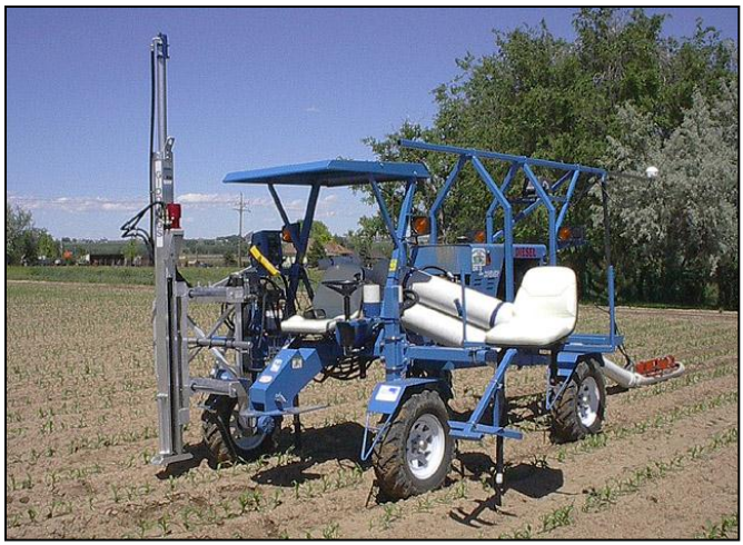
Figure 2. The Coachella Valley Resource Conservation District "Salt Sniffer," used to measure soil salinity

The ECP enabled growers to refine their application of water for leaching, targeting areas of fields identified as high in salinity. In some cases, this could conserve water, by avoiding untargeted leaching or optimizing leaching volumes, though the ECP did not specifically identify savings resulting from better salinity management rather than better irrigation management. Instead, the program simply determined water conservation by entities in the program generally. To optimize crop production, the consultant would recommend the application of more water for leaching than had been applied historically, if it determined that soil salinity warranted such action.