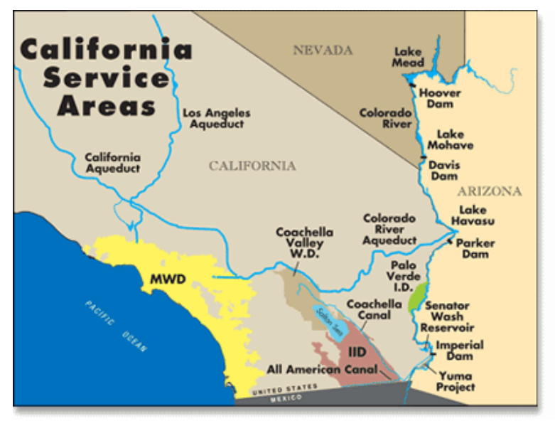
Figure 1. California districts receiving Colorado River water