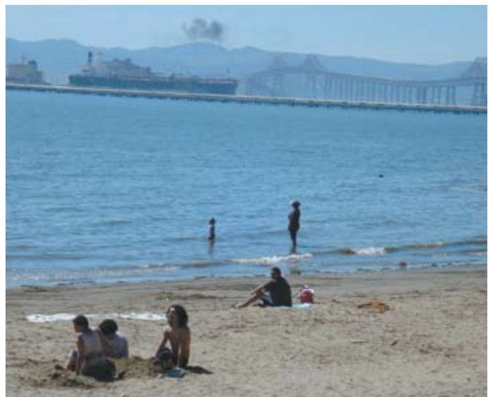
Keller Beach and the Chevron Pier