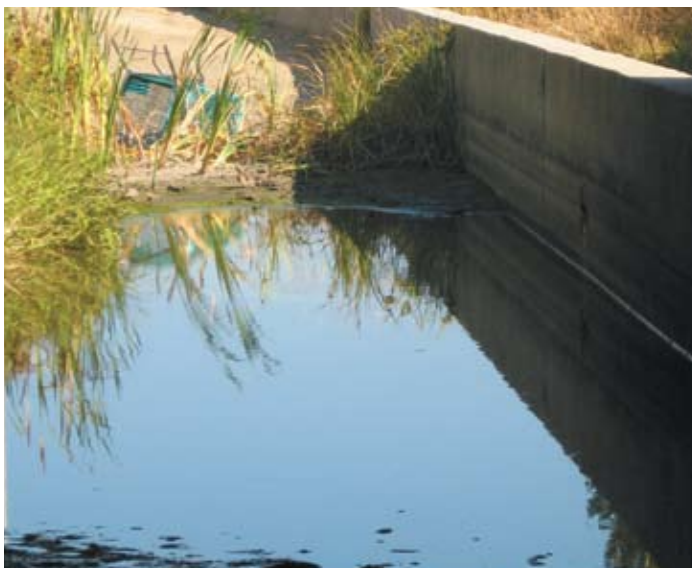
Wildcat Creek at the Richmond Parkway

Another limitation in our data is the state database itself, as CIWQS has been the subject of significant criticism. In May 2007, an independent panel reviewed the system and found the CIWQS to be “a dysfunctional program on the verge of collapse. There were serious and unresolved concerns about the technical soundness of the underlying database design and its implementation.” 24